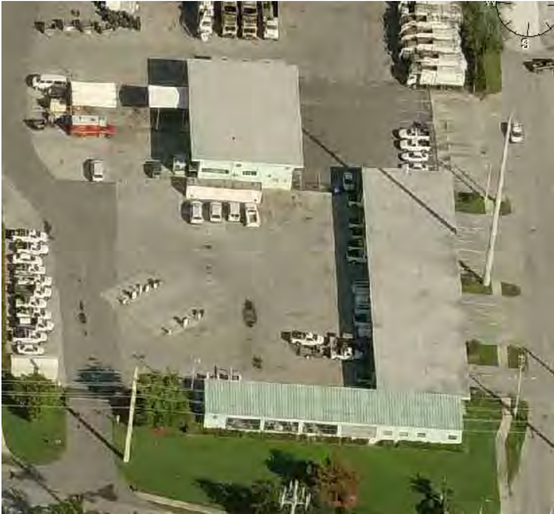
MUNICIPAL SERVICES BUILDING and GARAGE 3801 NE 5TH AV