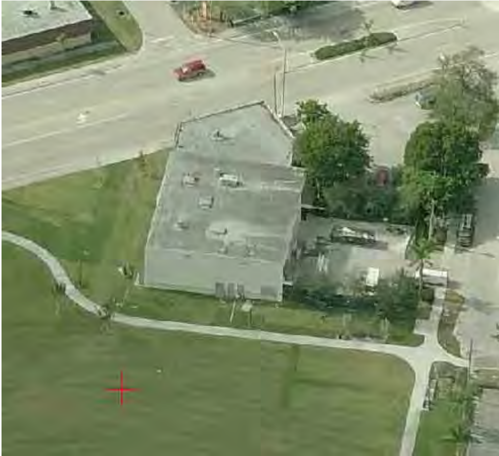
JACO PASTORIUS COMMUNITY CENTER 4000 N DIXIE HWY