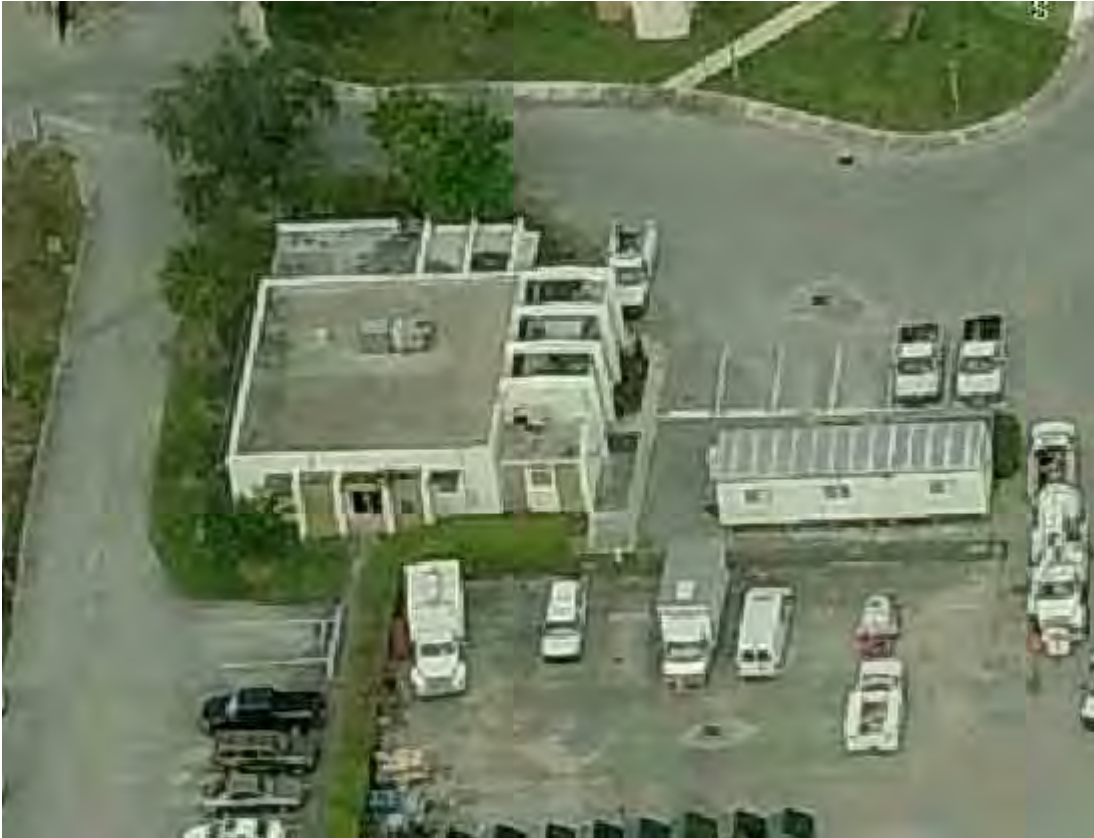
PUBLIC WORKS OPERATIONS 5100 NE 12TH TER