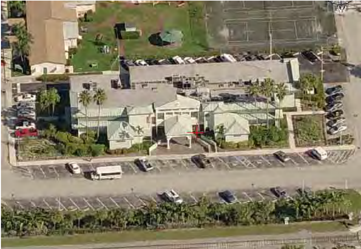
CITY HALL 3650 NE 12TH AVE