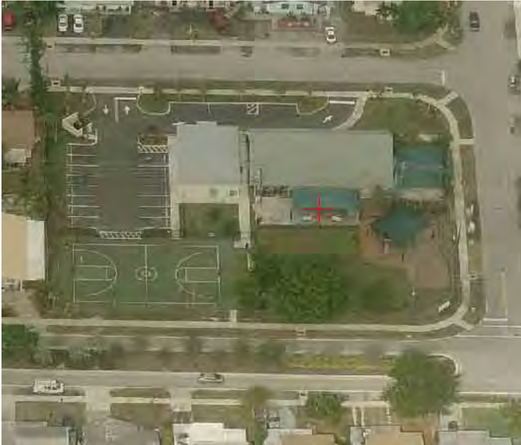
NORTH ANDREWS GARDENS COMMUNITY CENTER 250 NE 56TH CT