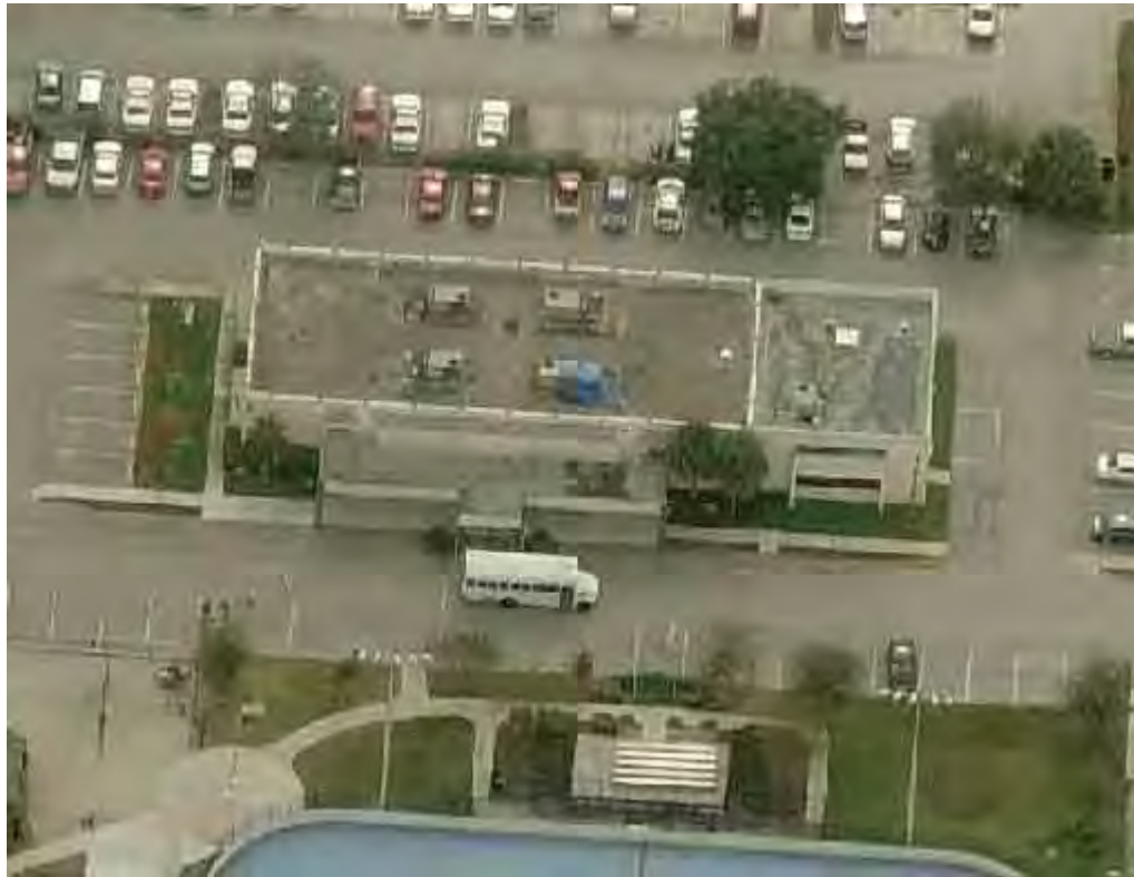
COLLINS RECREATION CENTER 3900 NE 3RD AV