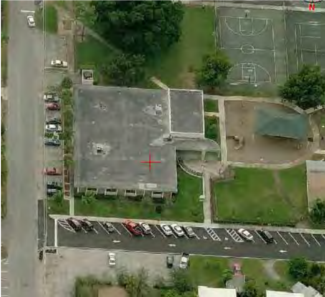
LIBRARY 1298 NE 37TH ST