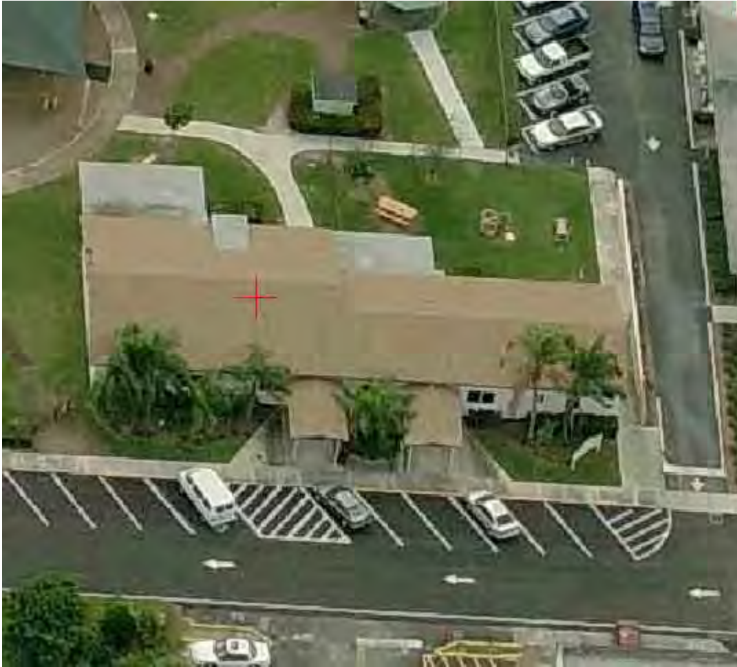
SPIHER RECREATION CENTER 1246 NE 37TH ST