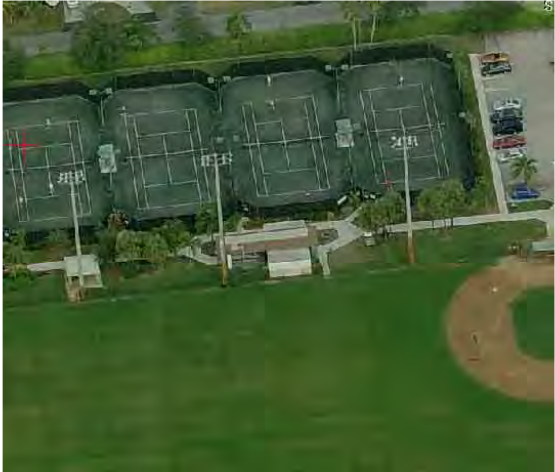
DILLON TENNIS CENTER 4091 NE 5TH AV