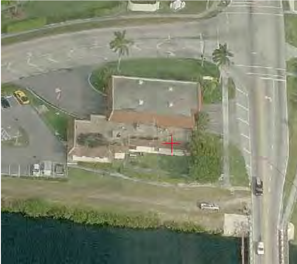
FIRE STATION #87 2100 NW 39TH ST