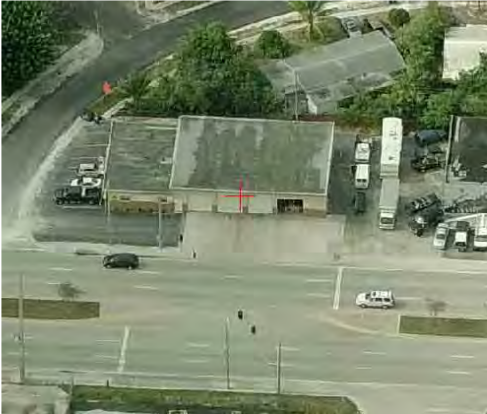
FIRE STATION #20 4721 NW 9TH AV