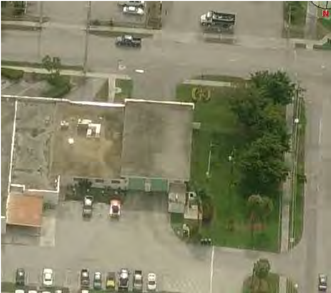
FIRE STATION #9 301 NE 38TH ST